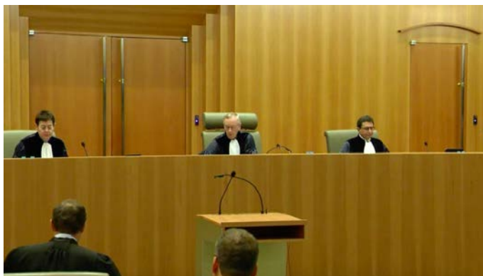
Minority SafePack Initiative.

The European Court of Justice issued its first judgment on a European Citizens' Initiative. It decided against the initiative "For a Europe of Solidarity". This initiative has a completely different subject than the Minority SafePack Initiative, but the judgment nevertheless contains a number of interesting aspects. The Court finds that the European Commission has an obligation to state very clearly the reasons why it rejected a proposal. Once their proposal to use this high-praised instrument of direct democracy, is rejected, the citizens have a right to receive a well-founded reasoning for this rejection.