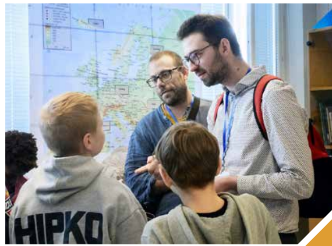
At Mattlidens skola, during the last annual meeting in Helsinki, 10.04.2024

Finland is known for the quality and efficiency of its education system. This is evidenced by the consistently excellent results of pupils in the PISA tests. The situation of the Swedish minority in Finland is also enviable, as the Swedish language has been recognised as a national language along with Finnish, which means that every Swedish-speaking child can start school in their mother tongue. So it is not surprising that this meeting attracted many of our members who are looking for inspiration and best practices that they can implement in their respective minorities.