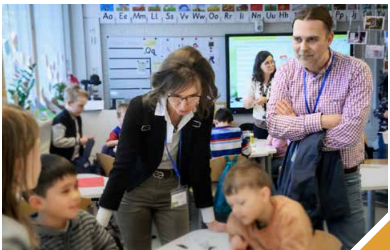
At Mattlidens skola, during the last annual meeting in Helsinki, 10 April 2024

Together with the family and the community, the school is the cornerstone for the teaching and preservation of minority languages and cultures. This realisation gave rise to the idea of the Working Group on Education, which was founded during the FUEN Congress 2017 in Cluj, Romania. The aim of the working group is to create a benevolent and supportive framework in which FUEN member organisations can exchange views on educational issues. Within a network that grows year after year, our members and partners can meet, be inspired by best practices, inform and educate themselves, in short: empower themselves, find the strength and leverage to advance the cause of their minorities.