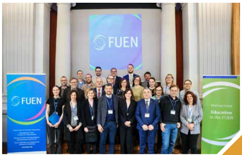
Conference room, on the premises of the Svenska Folkskolans Vänner foundation. Annual meeting in Helsinki, 9.04.2024

Subsequently, the annual meeting of the Education WG took place from 8 to 11 April 2024 in Helsinki/Helsingfors (Finland) and brought together 21 participants from 12 European countries. The participants were invited to expert lectures at the premises of the Svenska Folkskolans Vänner foundation and familiarised themselves with the situation of Swedes. The participants were able to gain practical experience by visiting Mattlidens skola, a school for the Swedish minority.