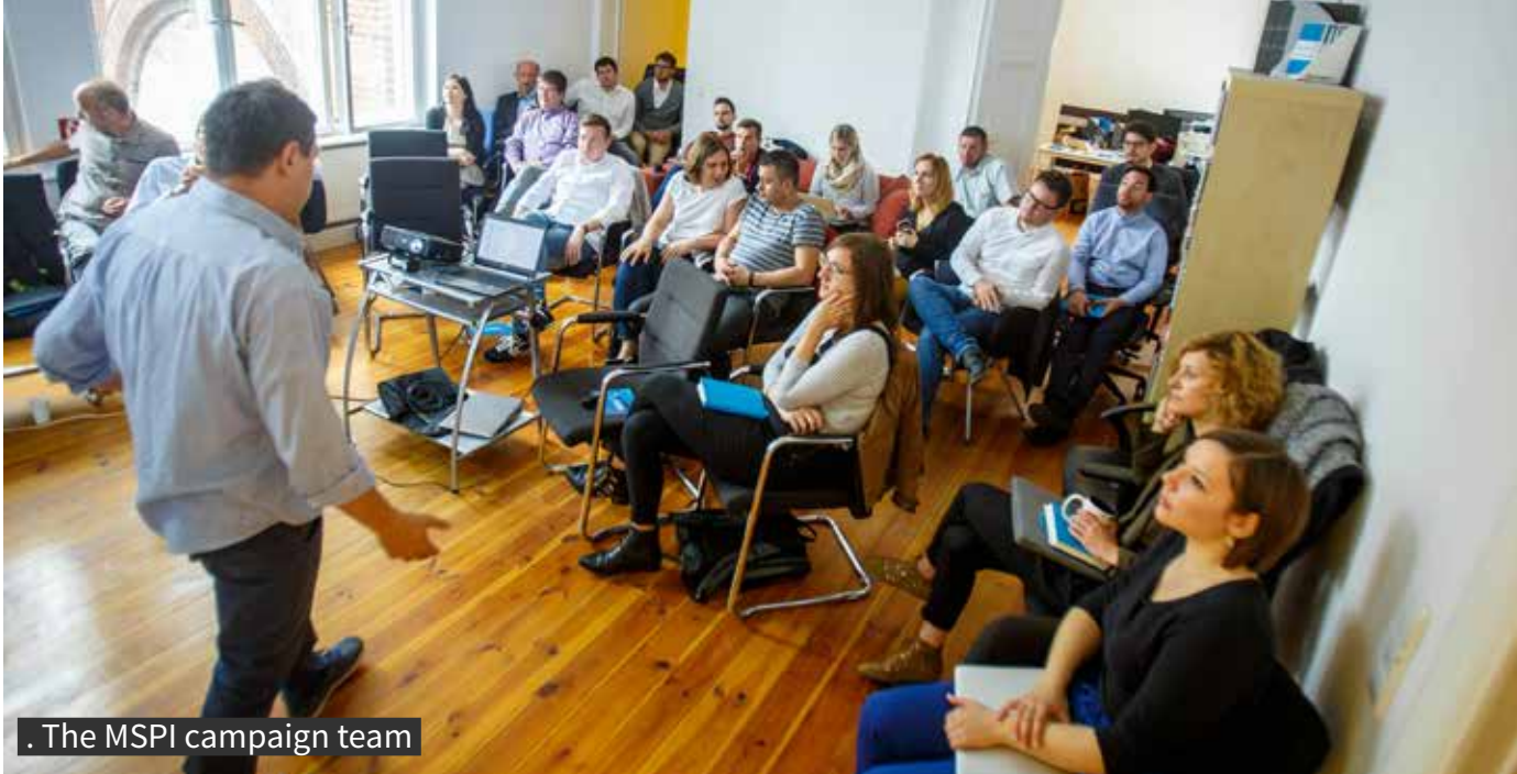
. The MSPI campaign team