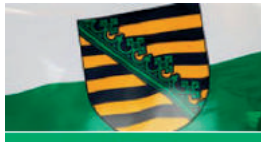
Free State of Saxony, Germany